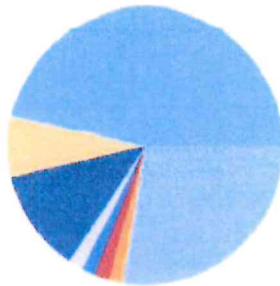
% of Incidents per Zone

Incident Status: Reviewed | Start Date: 01/01/2025 | End Date: 01/31/2025