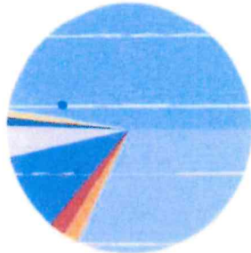
% of Incidents per Zone

Incident Status: Reviewed | Start Date: 01/01/2025 | End Date: 12/31/2025